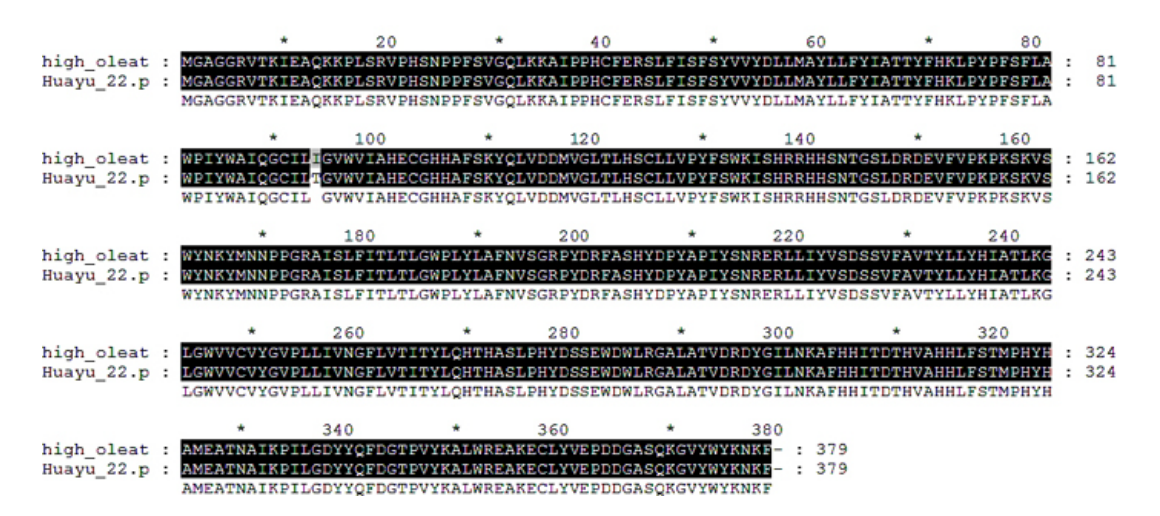
Fig. 3 Difference in amino acid sequences of FAD2B coding oleoyl-PC desaturase from high oleate mutant and normal oleate cultivar Huayu 22, note an I94T substitution in high oleate mutant.

A small peanut seed portion distal to embryo end, weighing 50 mg or more, were cut off as the starting material, whose oleate content was determined by gas chromatography (GC) as described by Zeile et al. (1993).